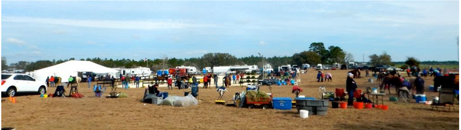
Well, maybe not so much sun but it sure was fun!!!